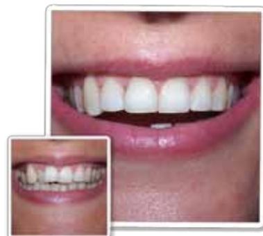
6 Month Smiles