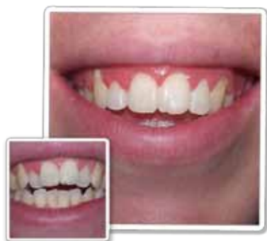
6 Month Smiles

Like adults, prevention is the key, and regular continuing care children's mouth MOT's are the best way to look after your children teeth.